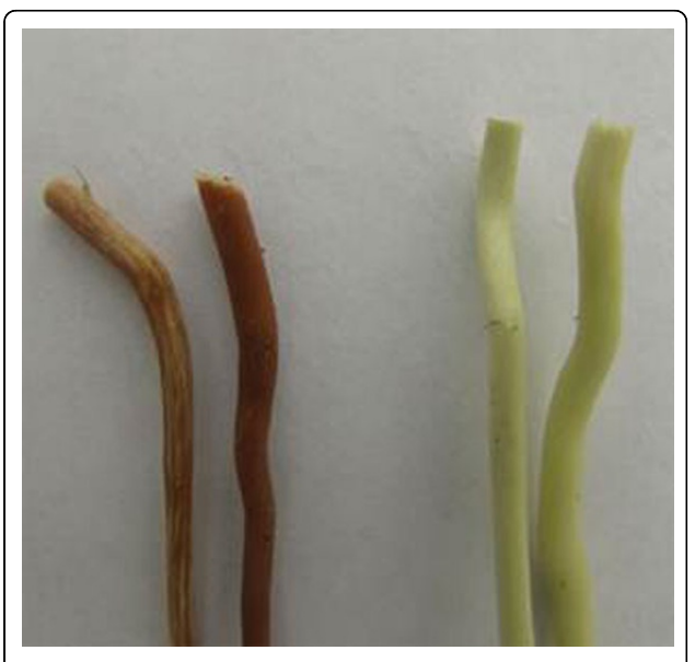
Figure 2 Stem wood coloration of control (right) and transgenic 4CL plants (left).

were selected as a result of transformation. Presence of bar gene was confirmed in all lines. Herbicide resistance was observed at 16 and 7 lines of aspen and birch respectively. Lines tested in a greenhouse demonstrated normal phenotype without somaclonal variations and may be recommended for the field trials.